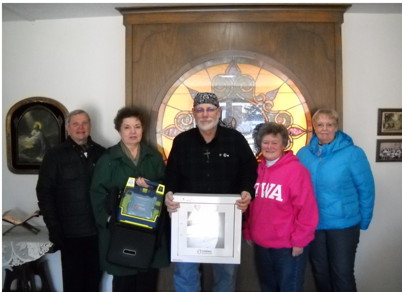
United Methodist Church, Corydon (shown above)

Any Iowa business or community organization with a determined financial need interested in obtaining an AED is encouraged to contact the Iowa Heart Foundation at 515-633-3555 to obtain an application form.