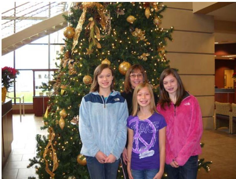
"2010 4th Quarter Volunteer Award"