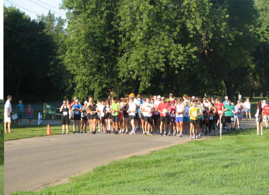
2011 Run For Your Life Runners Line Up "On Your Mark, Get Ready, Go!"